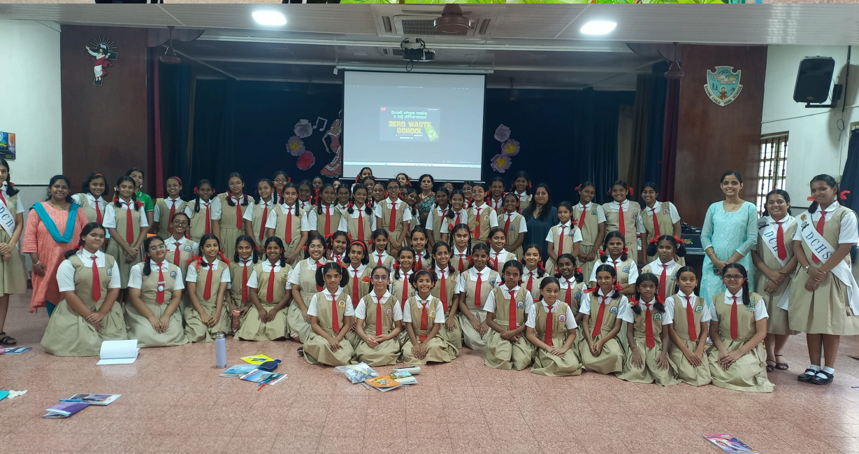
Mumbai, Maharashtra, India 54, Andheri - Kurla Rd, Dr. Charatsingh Colony, S B Singh Colony, J B Nagar, Andheri East, Mumbai, Maharashtra 400059, India Lat 19.112319° Long 72.863992° 18/07/2025 01:25 PM GMT +05:30